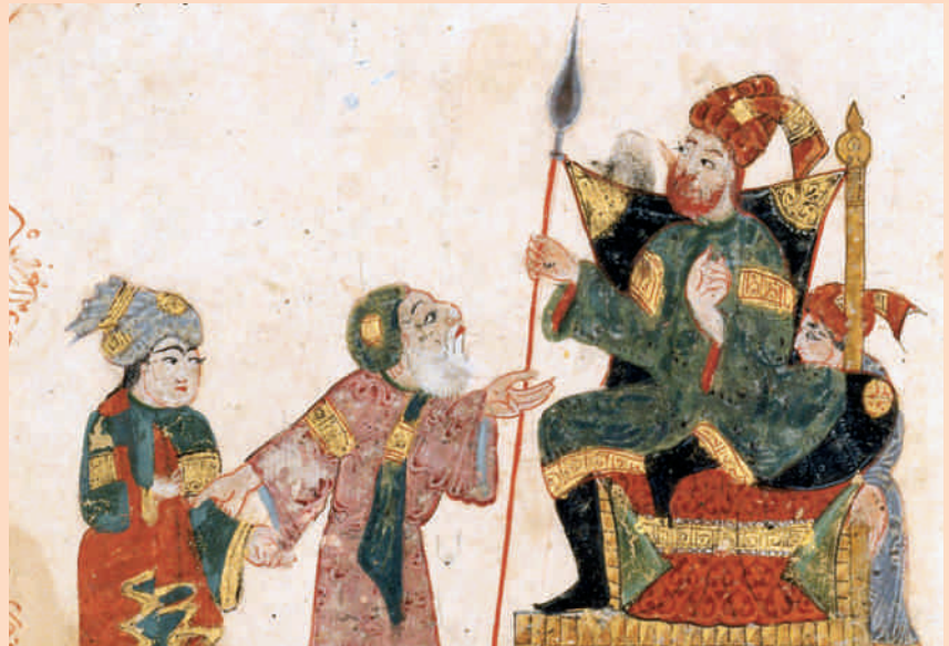
Bibliothèque nationale de France, Ms. Arabe 5847 (Schefer Hariri) folio 26 recto

Head coverings for women, as well as wigs and hairdressing styles, sometimes show greater diversity than those for men. This has been particularly true in societies where women of high status mix with men on public occasions. A magnificent wig, hat, or coiffure under these circumstances might speak